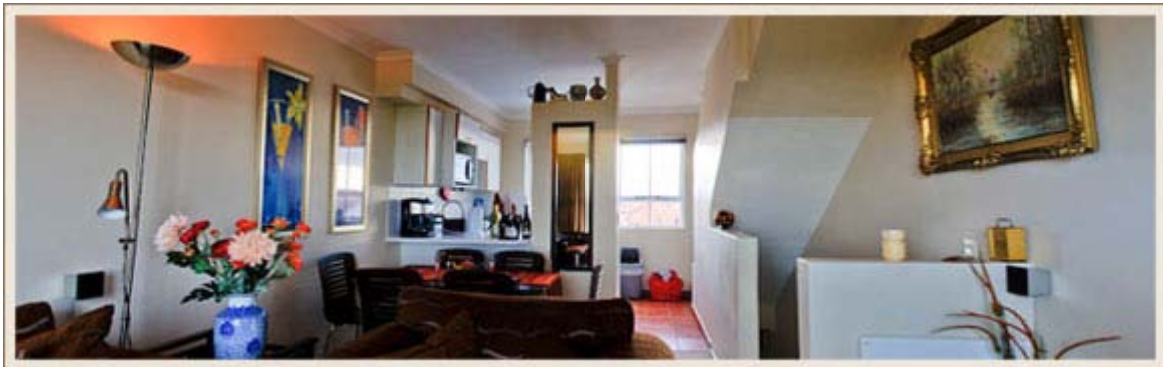
A small, 4-seater dining area and fully equipped kitchen with hob, mini oven, and fridge/freezer. The apartment has the owner's collection of original artworks and fine furnishings.

The south facing bedroom has two single beds, built-in cupboards, TV, DVD player, mini Hi-Fi and an unobstructed view of False Bay. The 2nd floor living area is characterized by its large glass sliding doors and clear view of Fynbos covered dunes, Sunrise Beach and the warm Indian Ocean. Furnishings include a flat screen TV, MNet satellite decoder (bring your card), surround sound DVD player and accompanying collection of series DVDs (CSI etc.).